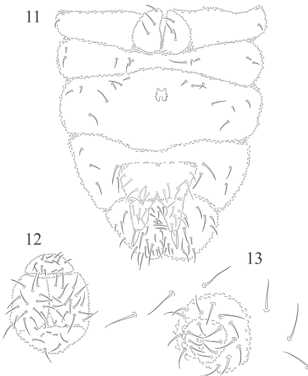
Figures 11-13. Aethiopella pilarandresae sp. nov. 11, abdominal ventral chaetotaxy; 12, genital and anal of female plates; 13, male genital plate.

10 circumgenital and 2 eugenital setae (Fig. 12). Genital plate of male with 3+3 pregenital setae, 12 circumgenital setae and 4+4 eugenital setae (Fig. 13).