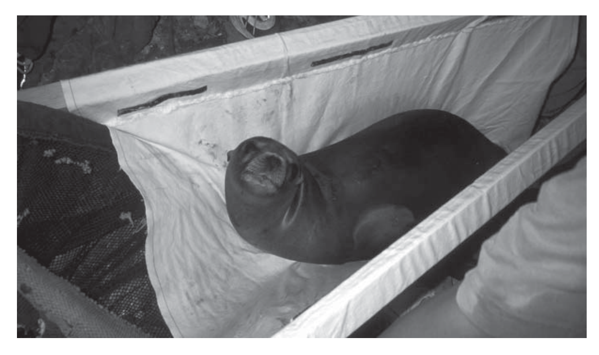
Figure 2. Sea lion pup inside the open stretcher, prior to wrapping.