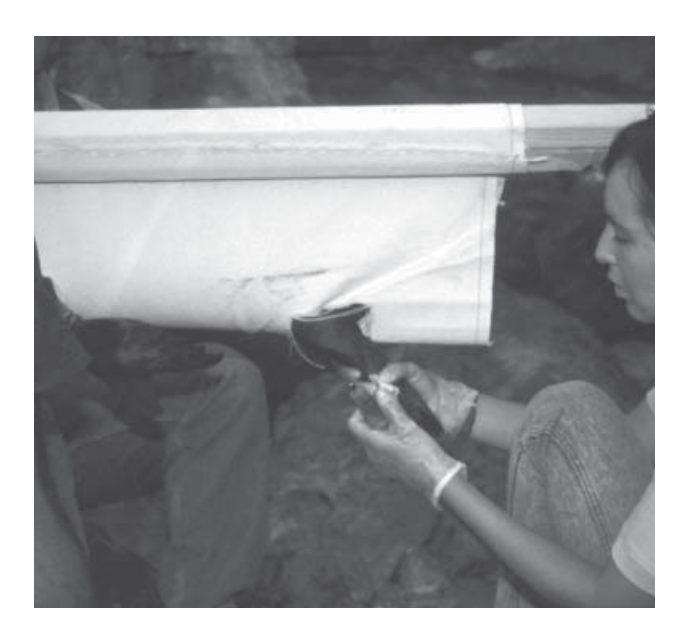
Figure 3. General view of the stretcher during blood sampling from the left hind limb.

in length from 69 to 100 cm. We believe that it could be used to restrain older and heavier individuals due to the robustness and length of the stretcher. After working with 40 pups, we verified that handling, transport, storage and cleaning of this stretcher is easy, and allows for excellent interaction with the restrained individuals.