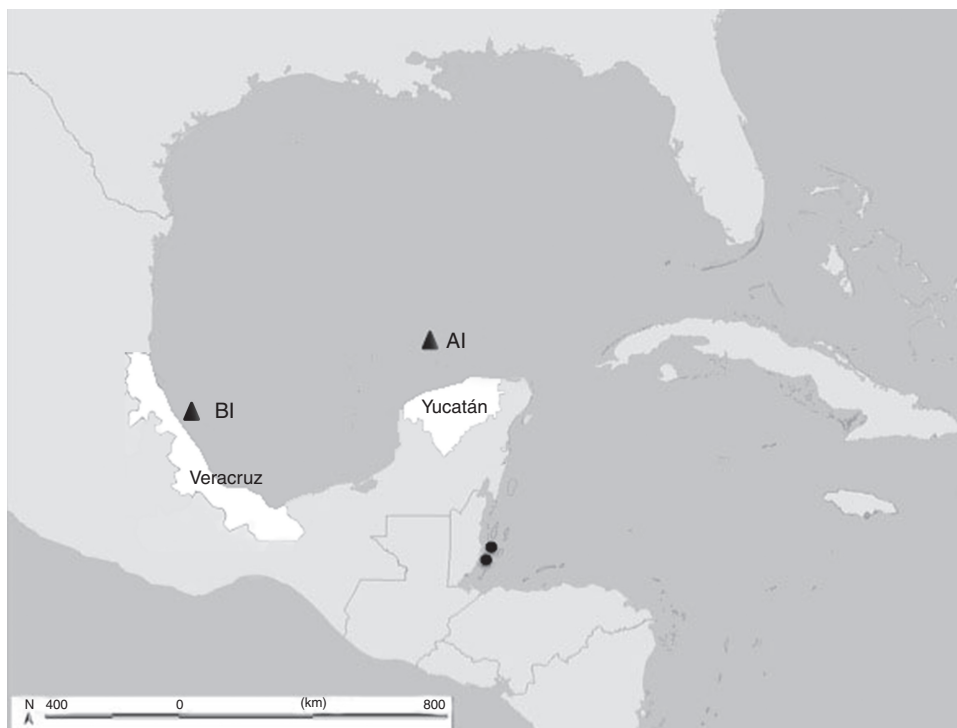
Figure 2. Distribution map of the species in the Gulf of Mexico (▲ new records: AI, Alacranes Reef; BI, Blake Reef).