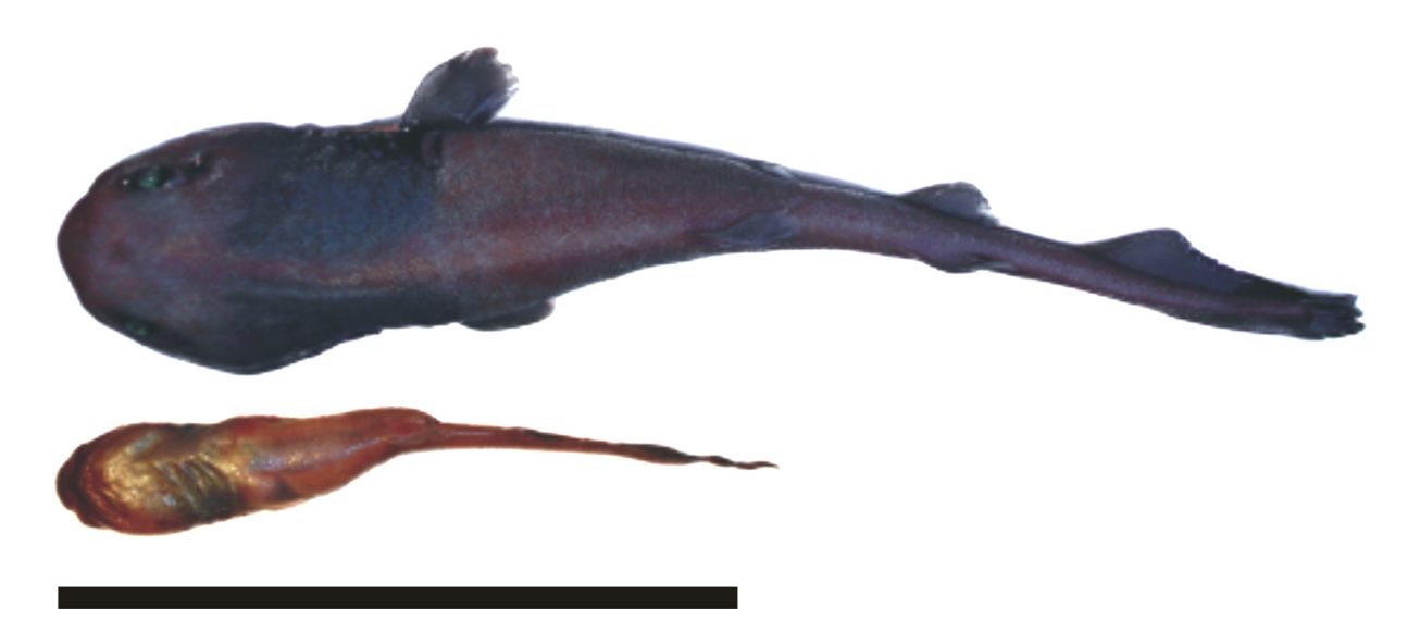
Figure. 1. Specimens of the lollipop catshark Cephalurus cephalus caught in the Gulf of California (Talud X, St. 12). a), dorsal view of a female 221 mm TL. b), ventral view of a female neonate 107 mm TL. Bar= 100 mm.

The lollipop catsharks were caught at a depth range of 464 to 486 m and at a temperature of 9.4°C, and where hypoxic (0.14 ml/l) conditions prevailed. In the southeastern Gulf of California, epibenthic dissolved oxygen concentration is always <0.5ml/l and occasionally <0.1 ml/l, limiting the occurrence of macroinvertebrate species that cannot tolerate severe hypoxic conditions (Hendrickx 2001, 2003). However, for C. cephalus this does not repre-